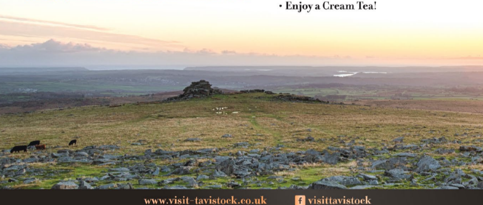
www.visit-tavistock.co.uk | visittavistock