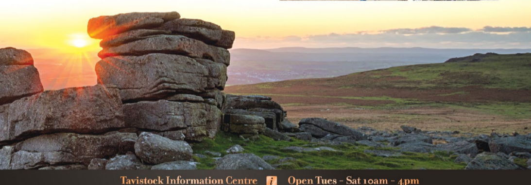
Tavistock Information Centre | Open Tues - Sat 10am - 4pm